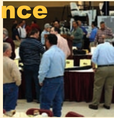
Conference attendees enjoy refreshments.