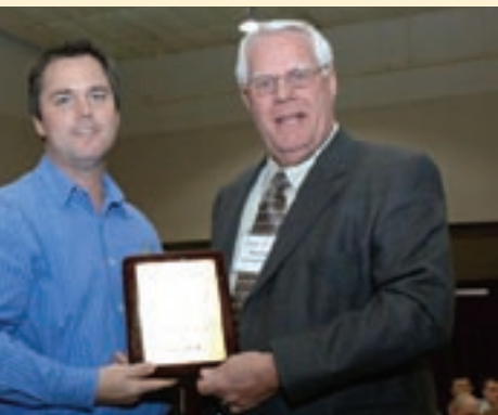
ley of APAC Missouri-Columbia Private and Commercial paving