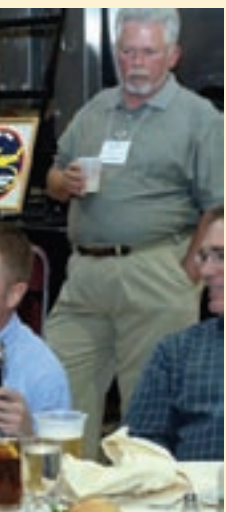
ement from uction. Good job,