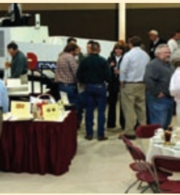
ments just before dinner.