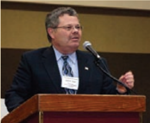
Chairman of House Transportation Committee, Rep. Neal St. Onge (R) District 88 Ballwin, MO, talks transportation at Asphalt Conference.